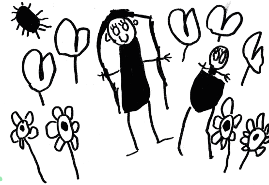
Asha, age: 5 years